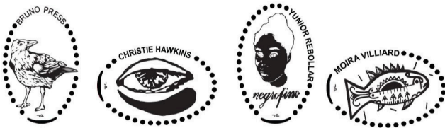
Featured Penny Designs