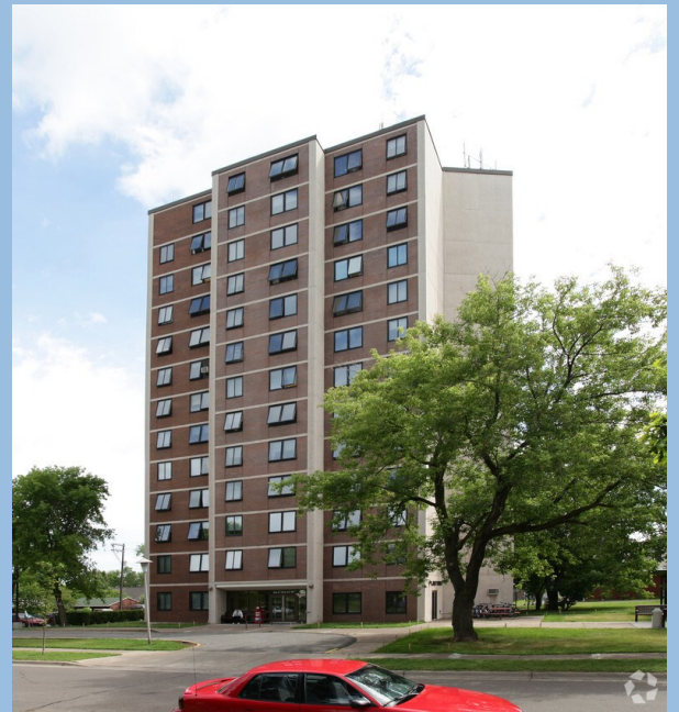
*Ramsey Manor, Duluth MN.

The Housing and Redevelopment Authority of Duluth (HRA) owns and manages over 1,100 public housing units within the City of Duluth, including scattered site single family homes, townhomes, and six high-rise apartment buildings. Additionally, the HRA administers over 1,500 Housing Choice Vouchers (section 8 vouchers), which keeps rents more affordable for qualified tenants. Waitlists for tenants to be placed in housing under both programs can be lengthy, sometimes a year or longer. The Housing Choice Voucher program, commonly referred to as "Section 8", allows tenants to choose their rental unit if the landlord agrees to participate. Public Housing units are available for rent at or below the market rate based on one's income.