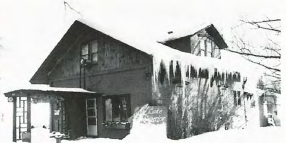
OLDE DEPOT INN - 1981