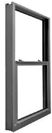
Example of Frame and Sash Window

NEW ALUMINUM STOREFRONT SYSTEM WITH INFILL PANEL -- PAINTED FINISH