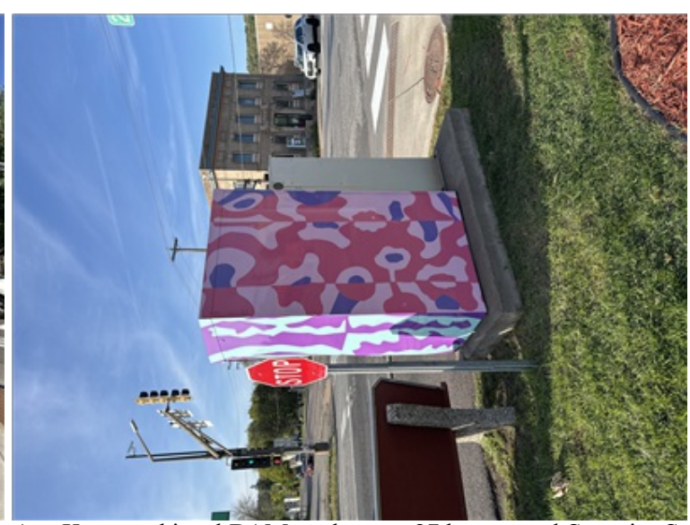
Aya Kawaguchi and BAM students at 27th av w and Superior St