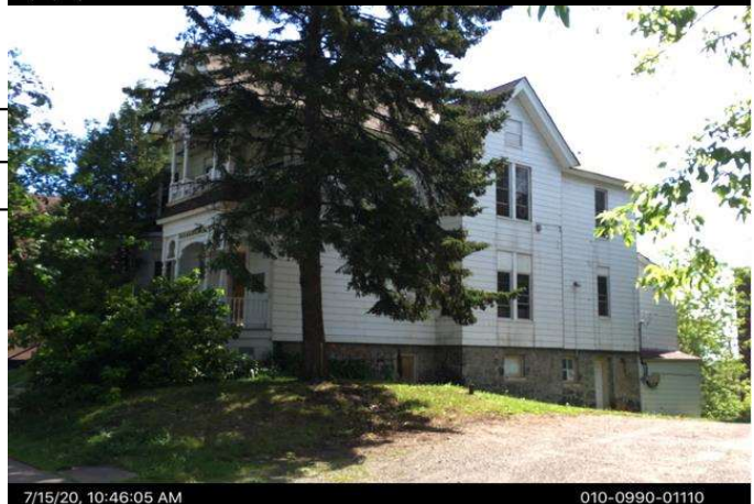
7/15/20, 10:46:05 AM