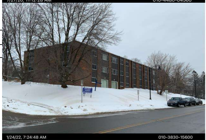
1/24/22, 7:24:48 AM

Seller: EARL L. RICHARDS REVOCABLE TRU 21