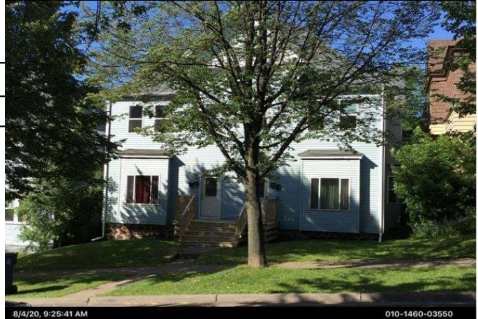
8/4/20, 9:25:41 AM