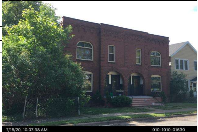
7/15/20, 10:07:38 AM