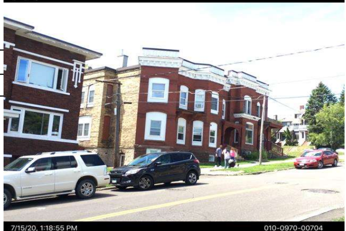
7/15/20, 1:18:55 PM