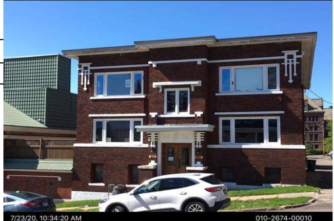
7/23/20, 10:34:20 AM