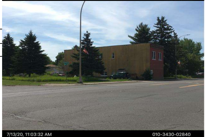
7/13/20, 11:03:32 AM