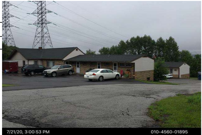
7/21/20, 3:00:53 PM