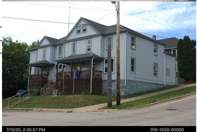
7/15/20, 2:35:57 PM