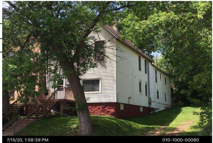
7/15/20, 1:58:39 PM