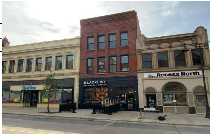
8/2/21, 8:01:18 AM

Seller: COOL & KOCON REAL ESTATE HOLDI 1