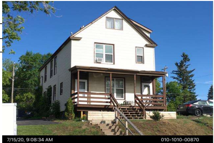
7/15/20, 9:08:34 AM