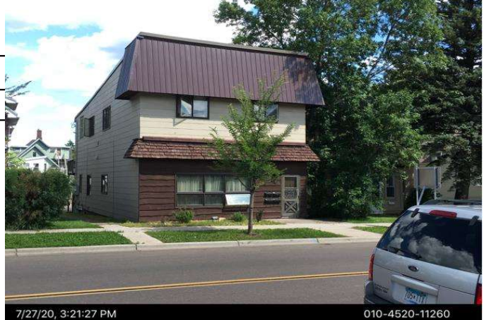
7/27/20, 3:21:27 PM