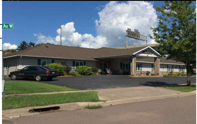
7/27/20, 11:12:28 AM